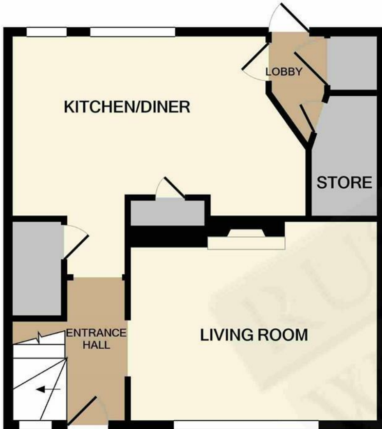
GROUND FLOOR APPROX. FLOOR AREA 403 SQ.FT. (37.4 SQ.M.)