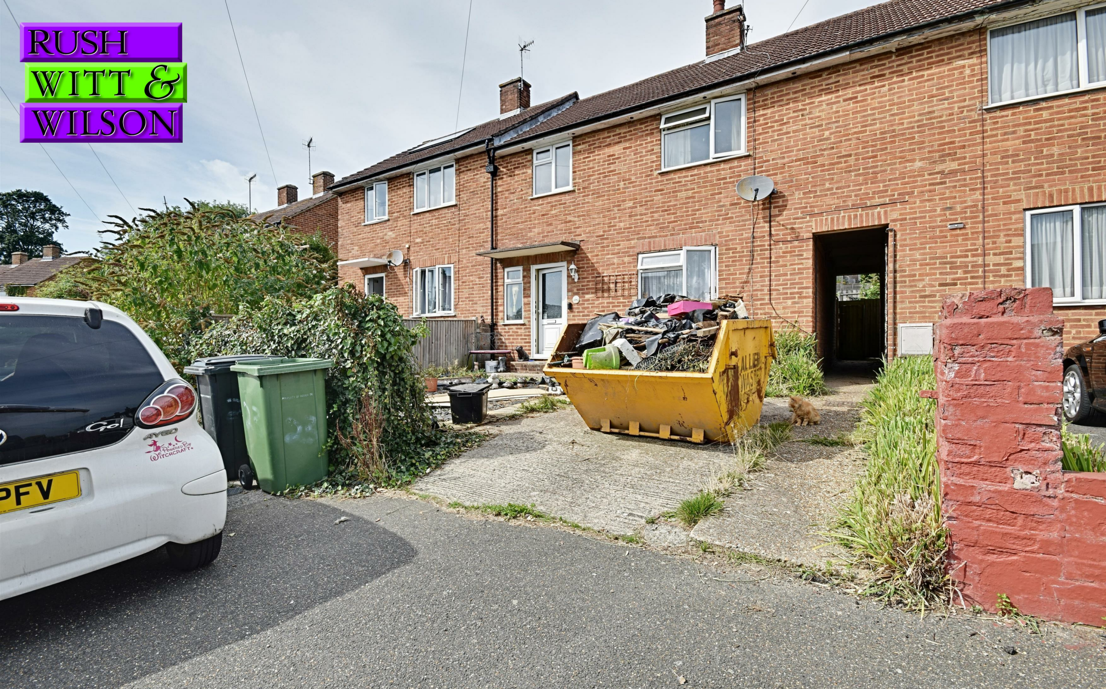
25 Paton Road, Bexhill-On-Sea, East Sussex TN39 5DJ £225,000